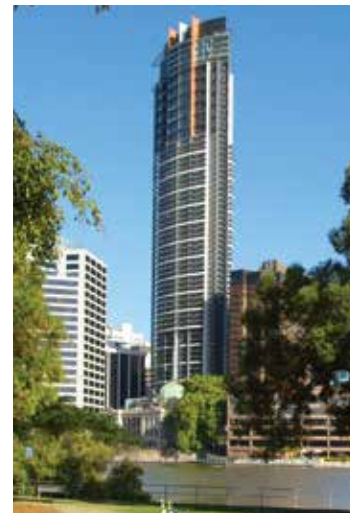
THE AURORA BRISBANE