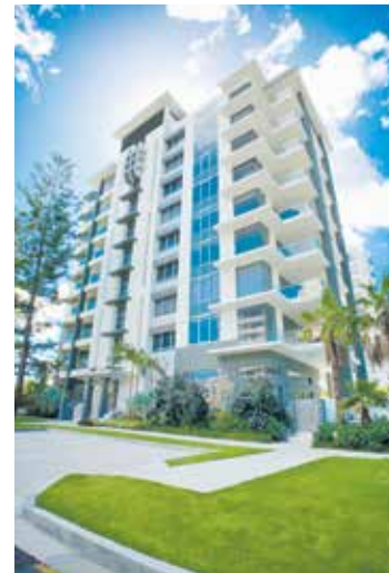
IVORY BURLEIGH BEACH