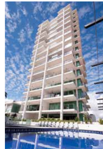
ELEMENT BURLEIGH BEACH