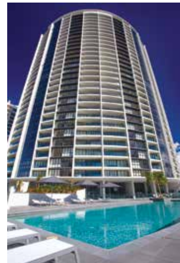
SIERRA GRAND BROADBEACH